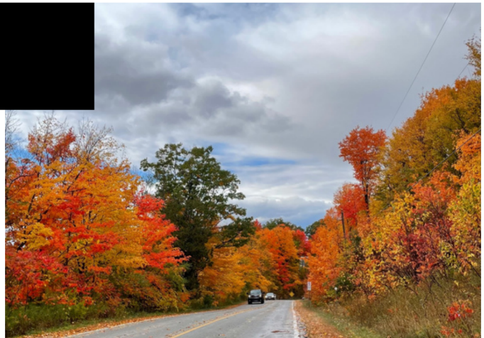
FALL COLOURS IN ONTARIO

16-22 Mar: International Leaders Meetings (ILM) in Northern Cyprus